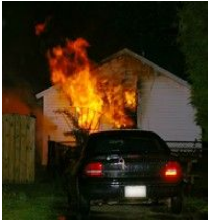
Fire conditions upon arrival 1005 S. River St.